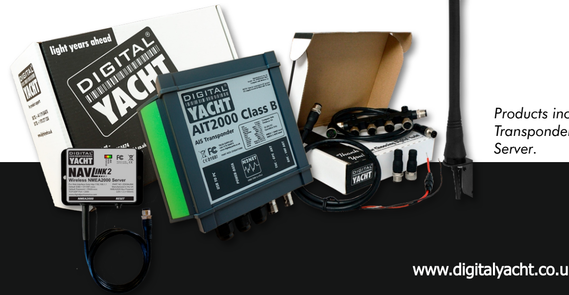
Products included with the AIS Transponder with NMEA 2000 to WiFi Server.

The product handbooks will also give further information on product operation, troubleshooting, interfacing etc as well as useful diagrams.