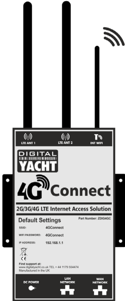
4GConnect Standard System